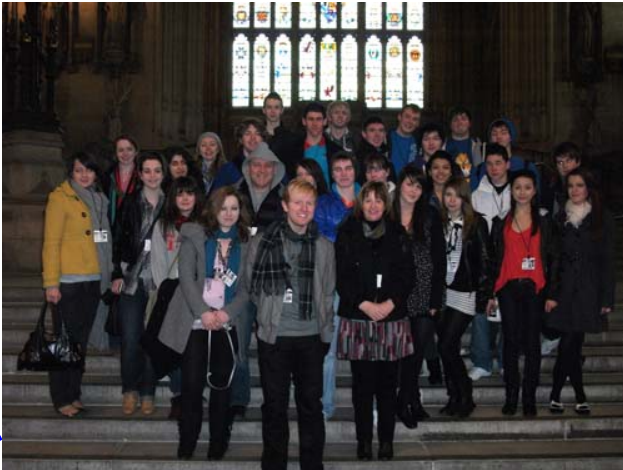
History and Politics trip