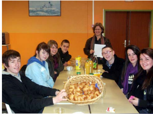
Students in Brest, France