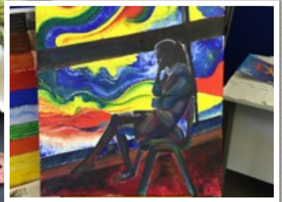
OUR FABULOUS EXHIBITION OF A LEVEL ART WAS ENJOYED BY FRIENDS AND FAMILY.