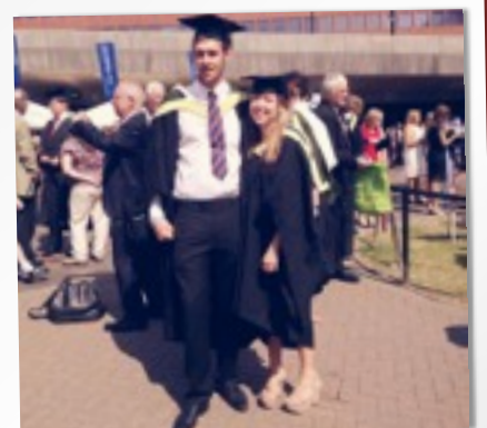
PADDY IN POLITICS