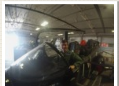
LIAM AND MORE LIAM